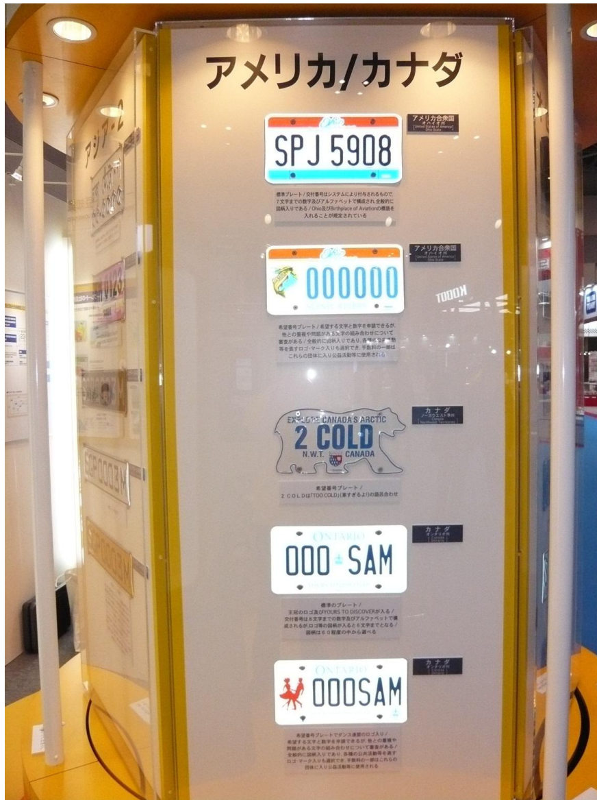
Rotary display (US/Canada)