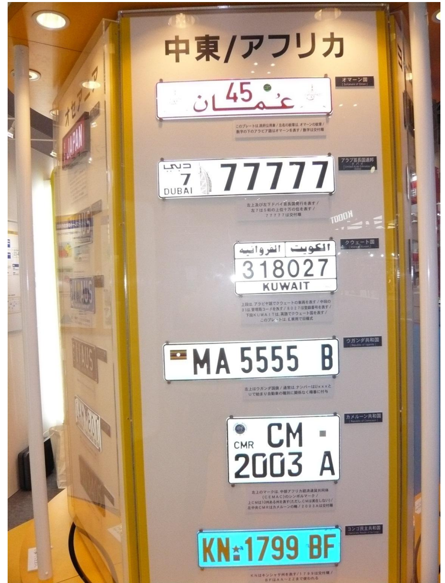
Rotary display (Middle East/Africa)