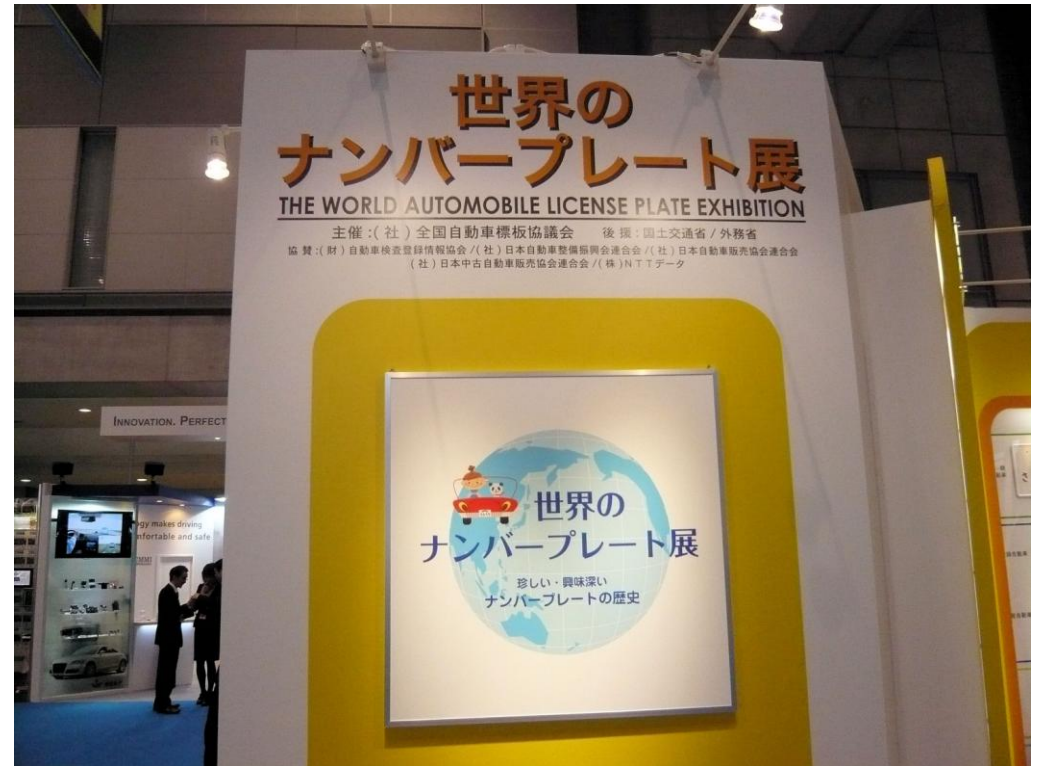
The exhibition was held under the auspices of the MLIT and MOFA and with the cooperation of related organizations