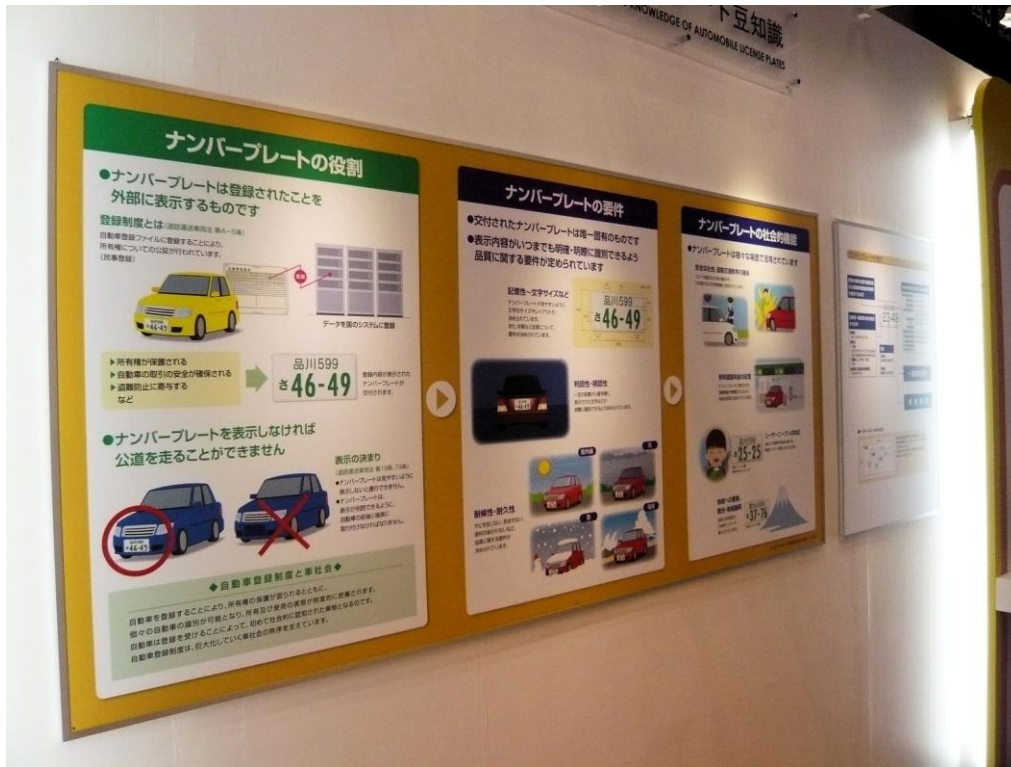
Presentation of the roles, requirements for, and social functions of automobile license plates