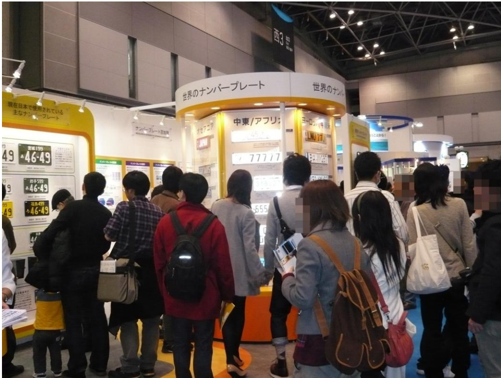
Visitors enjoying the exhibition