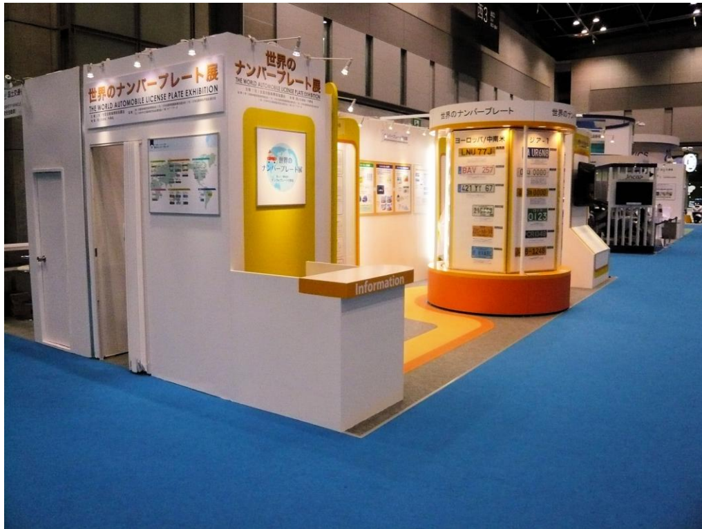
Most of the presentation was made on rotary display stands.