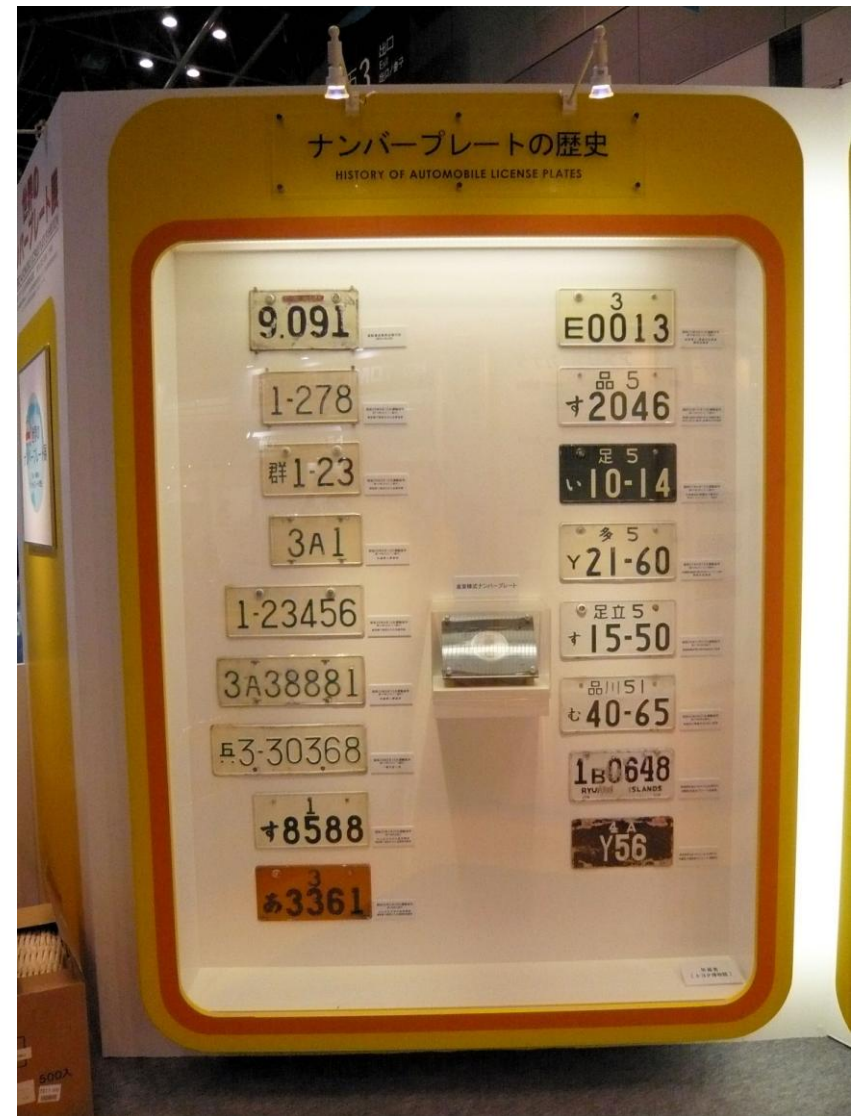
History of automobile license plates