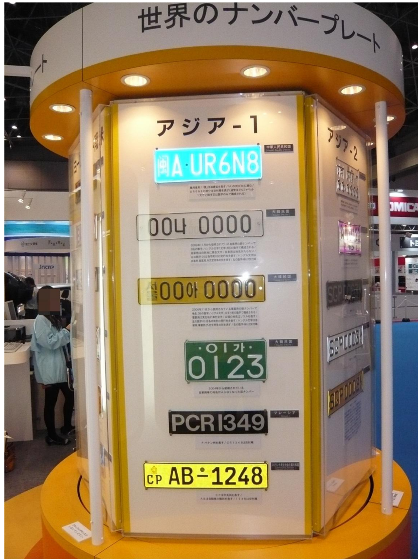
Rotary display (Asia 1)