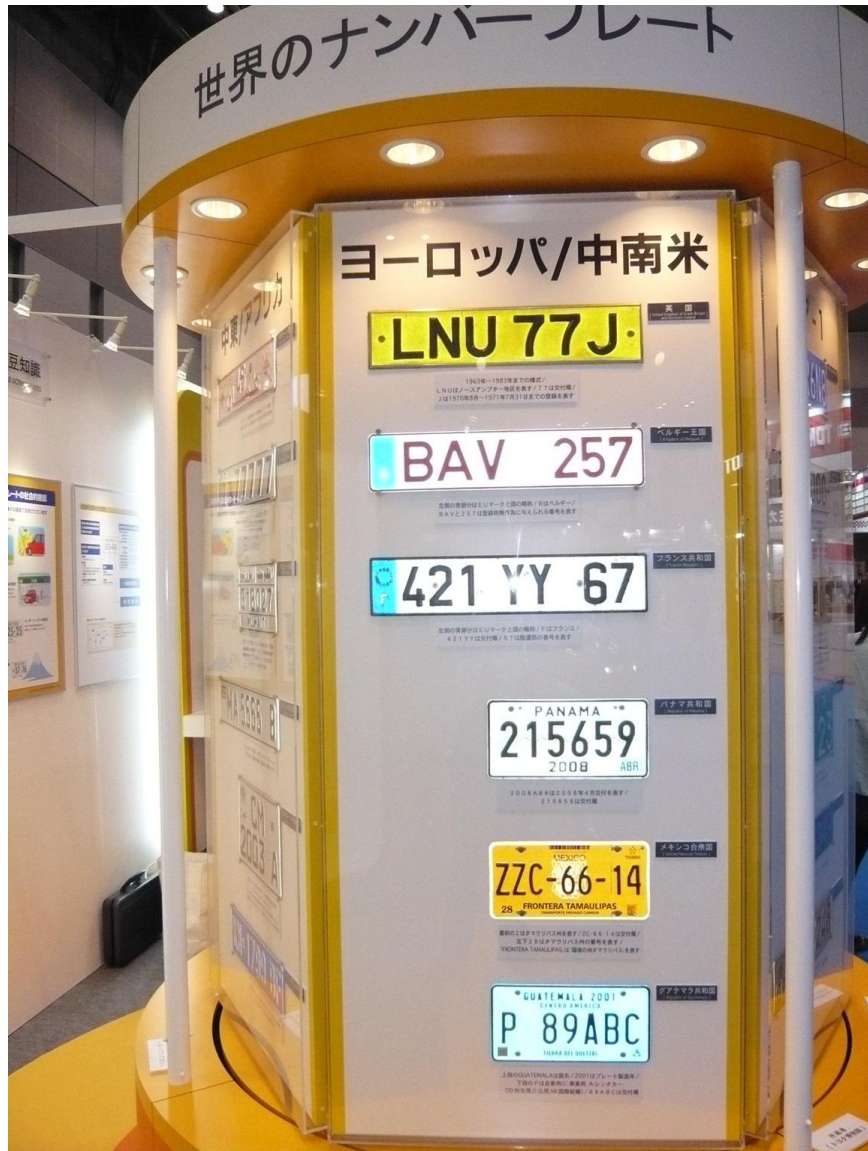
Rotary display (Europe/Central and South America)