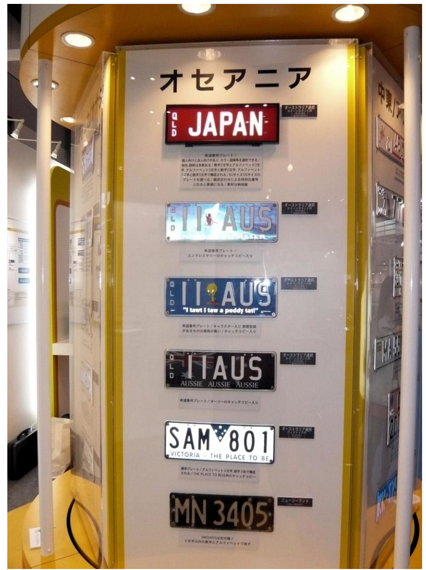
Rotary display (Oceania)