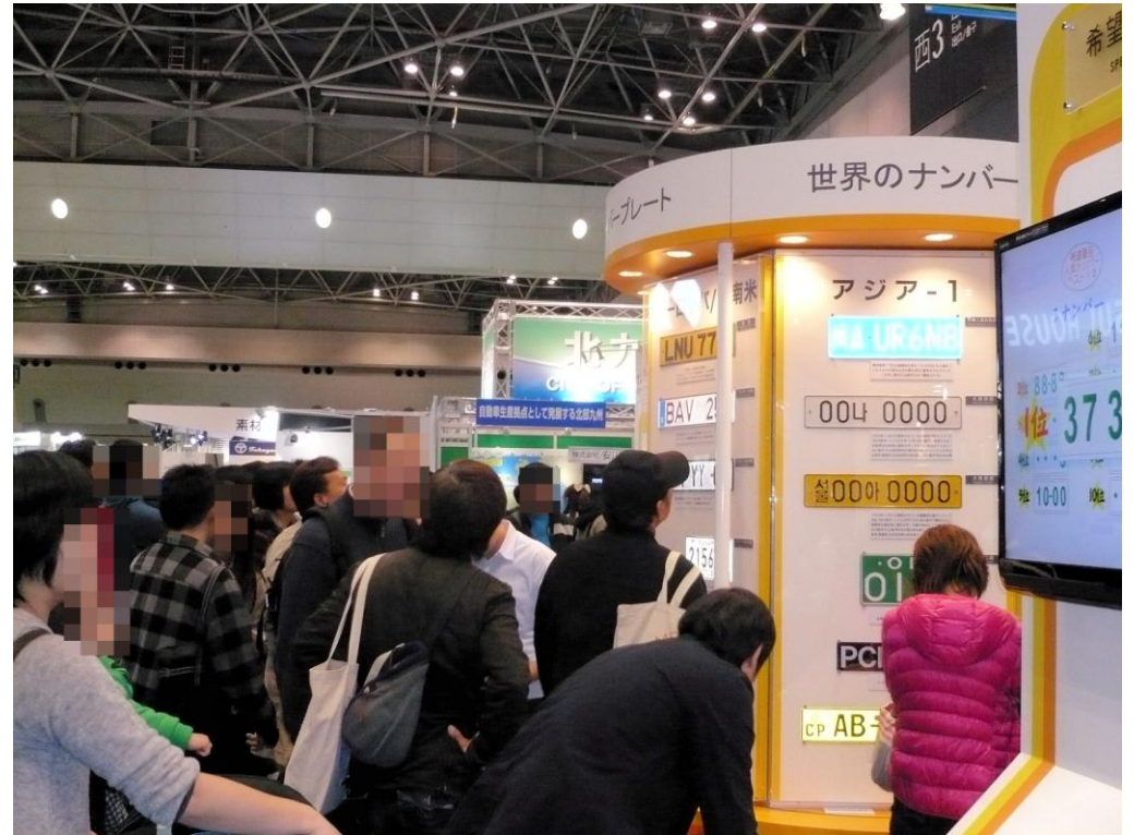
Visitors enjoying the exhibition