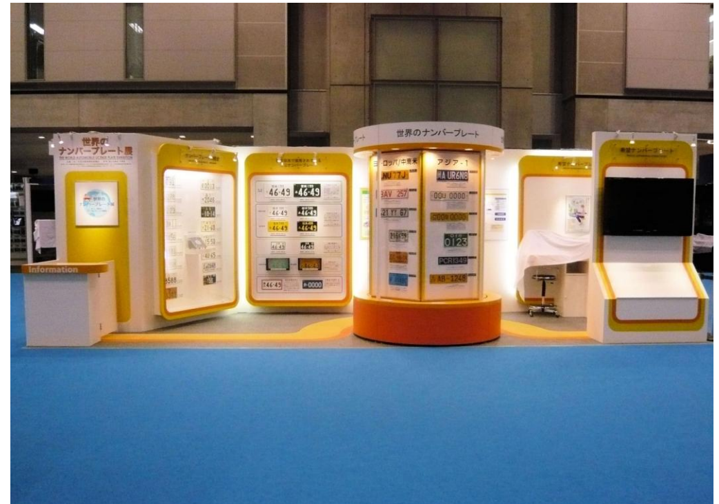
The World Automobile License Plate Exhibition

The exhibition, held under the auspices of the Ministry of Land, Infrastructure, Transport and Tourism and the Ministry of Foreign Affairs of Japan, ended in great success with more than 18,000 people visiting the booth. The photos below present some scenes of the exhibition.